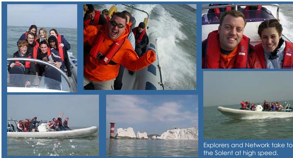
Explorers and Network take to the Solent at high speed.