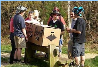
Feel The Bond

Next it was into the woods for the Forest Mission and a little Orienteering with bases. Most units were absolutely useless, but Octopussy completed most of the bases successfully, whilst the B47's stole most of the chicks around the woods, and possibly from the Management as well.