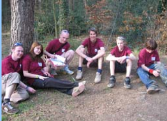
1036 Relaxing during Mission