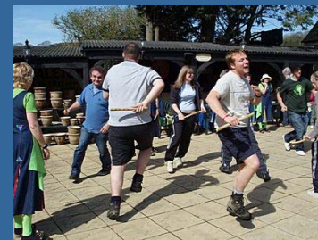
Morris Dancing at Dairyman's