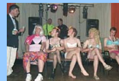
Bond Babe Comp