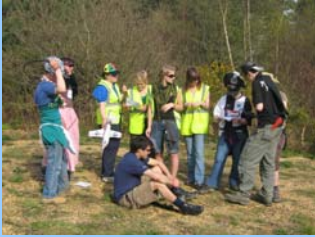
Revolution TV Trailer by.... Shabba